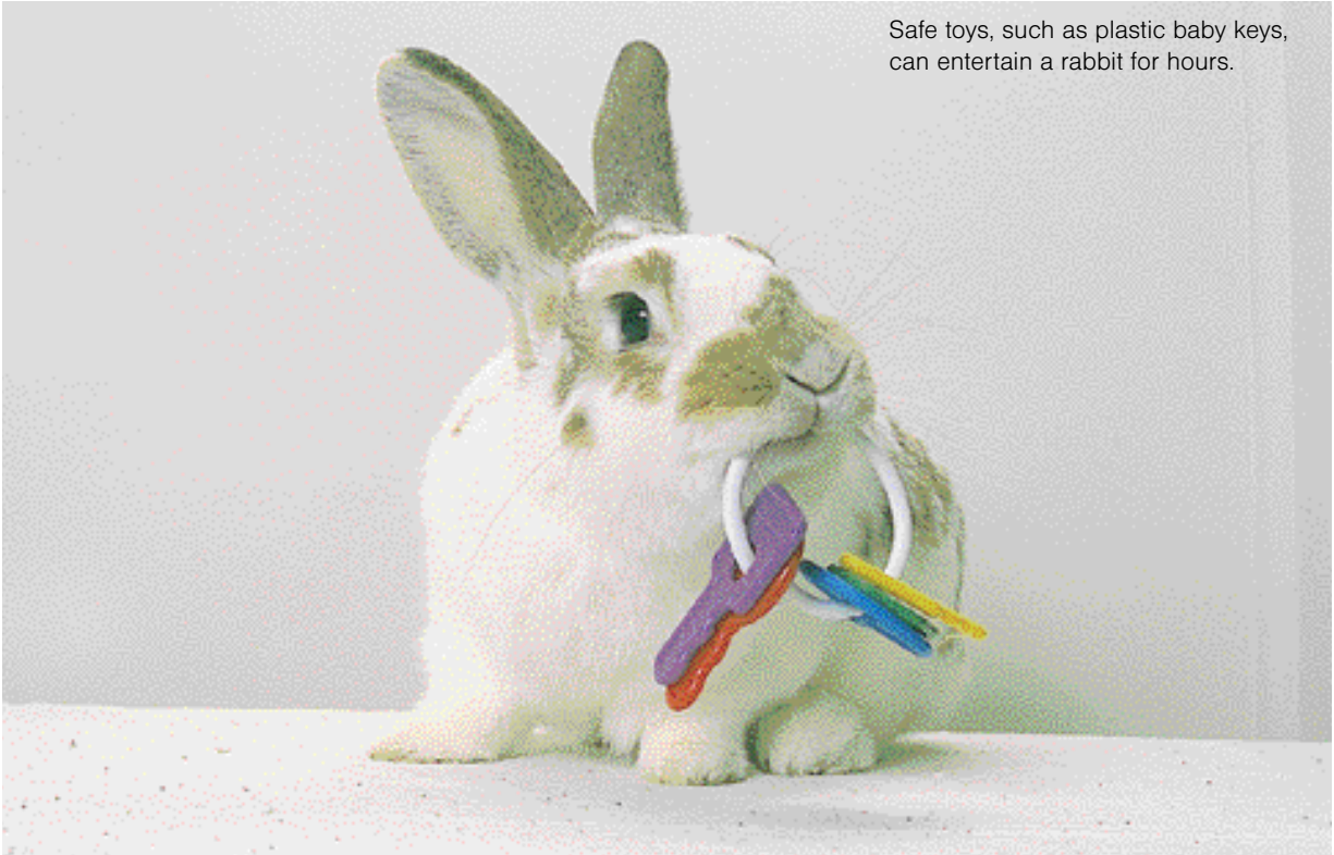
Safe toys, such as plastic baby keys, can entertain a rabbit for hours.