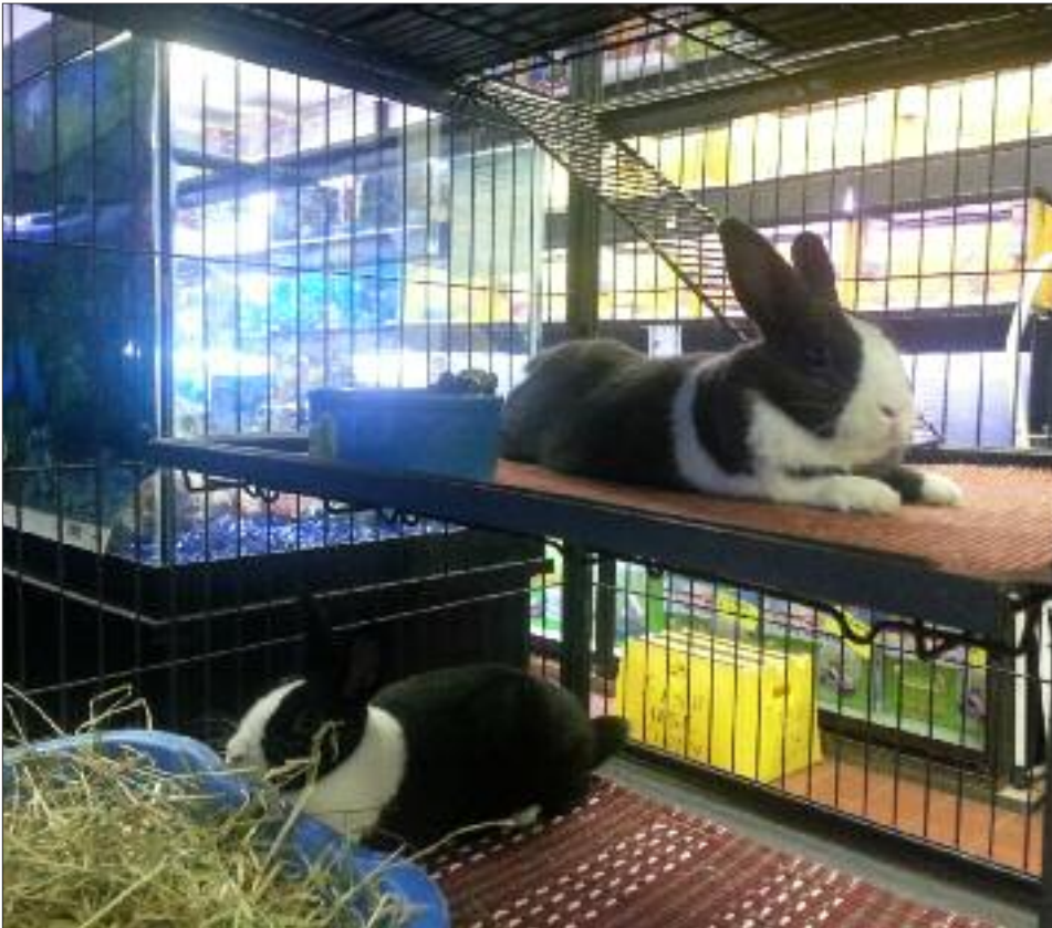
Batman and Puddles at 72nd Street Petland store.