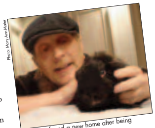
Bam Bam found a new home after being rescued in Elmhurst, N.Y.

rabbits in almost every neighborhood. But what the thousands of people who purchase baby rabbits every year don't know can hurt their chances of having an enjoyable relationship with their new pet. We all know that adoption is the humane thing to do. Adoption saves the adopted rabbit's life, of course. But adoption also helps save the lives of other rabbits waiting for shelter space. Third, adoption doesn't contribute to the miserable lives (Continued on page 4)