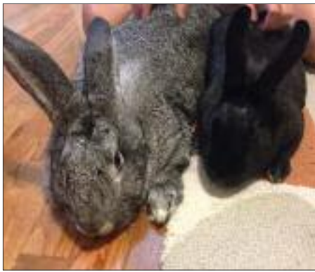
Gandalf and Sweet Pea.