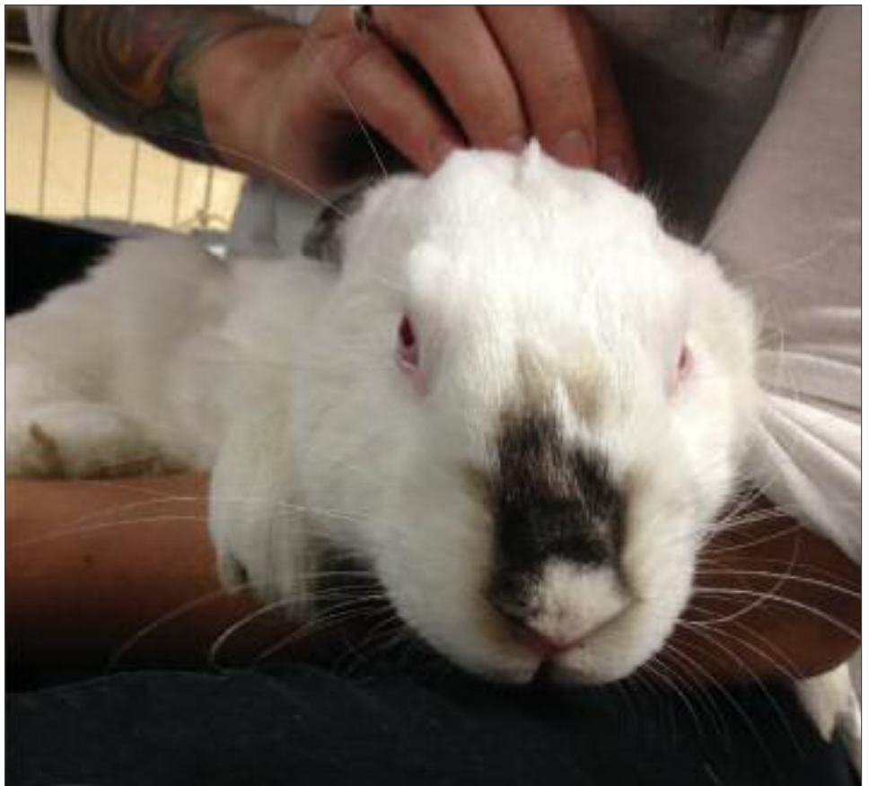
Cotton with volunteer.