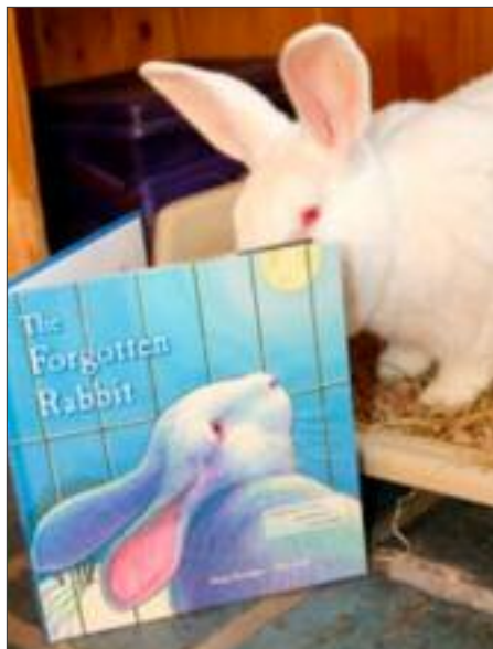
Marshmallow reading her book. http://www.thegryphonpress.com/ https://www.facebook.com/gryphonpress?ref=hl

The Gryphon Press had recently published one of my picture books: “Maggie’s Second Chance: A Gentle Dog’s Rescue.” It was loosely based on a big black dog I had rescued from an abandoned house. Black is beautifully mysterious, but if you’re a shelter dog, black often renders