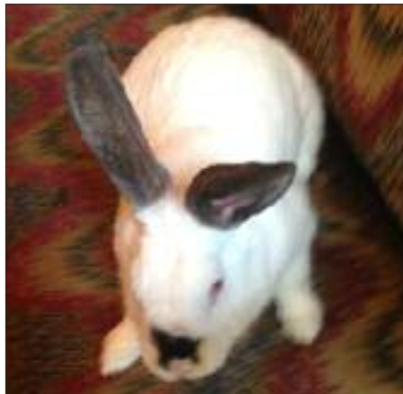
Another lobby shot.