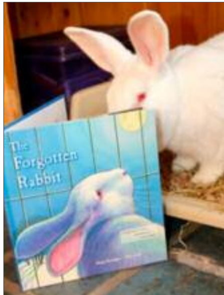
Marshmallow reading her book. http://www.thegryphonpress.com/ https://www.facebook.com/gryphonpress?ref=hl

The Gryphon Press had recently published one of my picture books: “Maggie’s Second Chance: A Gentle Dog’s Rescue.” It was loosely based on a big black dog I had rescued from an abandoned house. Black is beautifully mysterious, but if you’re a shelter dog, black often renders