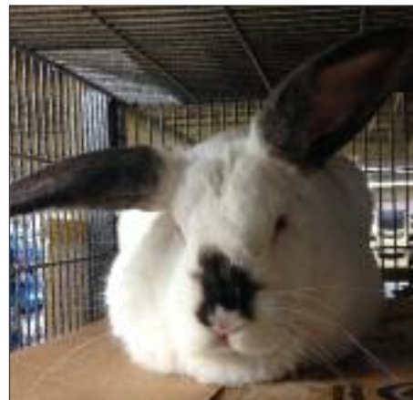
Back at Petco Union Square after the photo shoot.