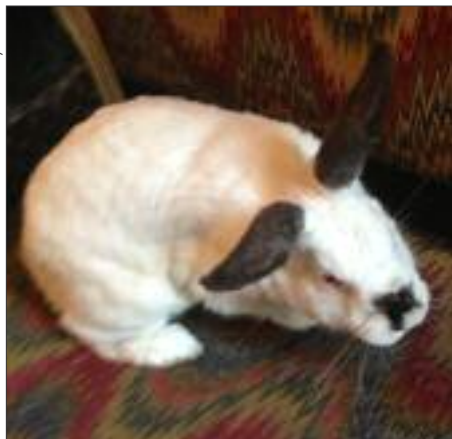
Cotton in the Jane hotel lobby.