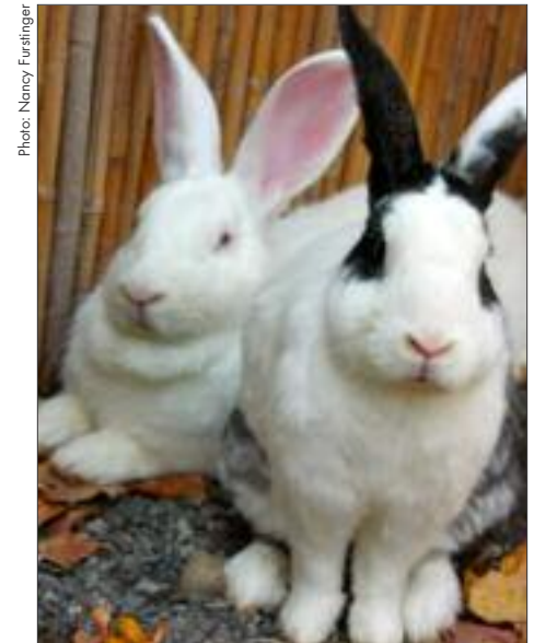
Marshmallow and Max.

Not only did The Gryphon Press sign up this title, but my publisher sent me an article about rabbit agility that had appeared in her local paper. Could I incorporate this sport into my book? I literally hopped at the opportunity. By having Rosalita, the child protagonist, rescue Bella the bunny and then encourage her to excel at agility, I was able to incorporate fun action verbs into “The Forgotten Rabbit”: zigzag, zoom, zip, rocket, torpedo, hop. And the artist was able to illustrate fun action scenes with homemade and professional agility courses.