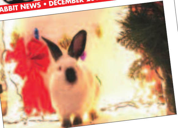
Bobo inspects the tree for hazards.

Go ahead and buy that poinsettia. They're festive and safe. Contrary to popular belief, poinsettias aren't toxic. That, however, doesn't mean they should become part of your bunny's holiday salad. They can cause mild intestinal discomfort if your rabbit has a sensitive stomach.