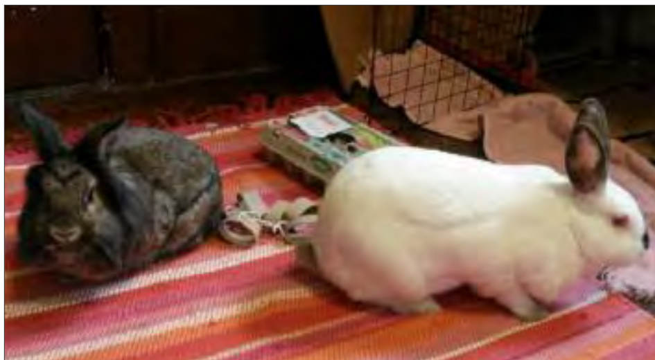
Logan and Arwen.

such innocent creatures who deserve safe, loving homes, and your rescue group is doing a wonderful job of making that happen!!