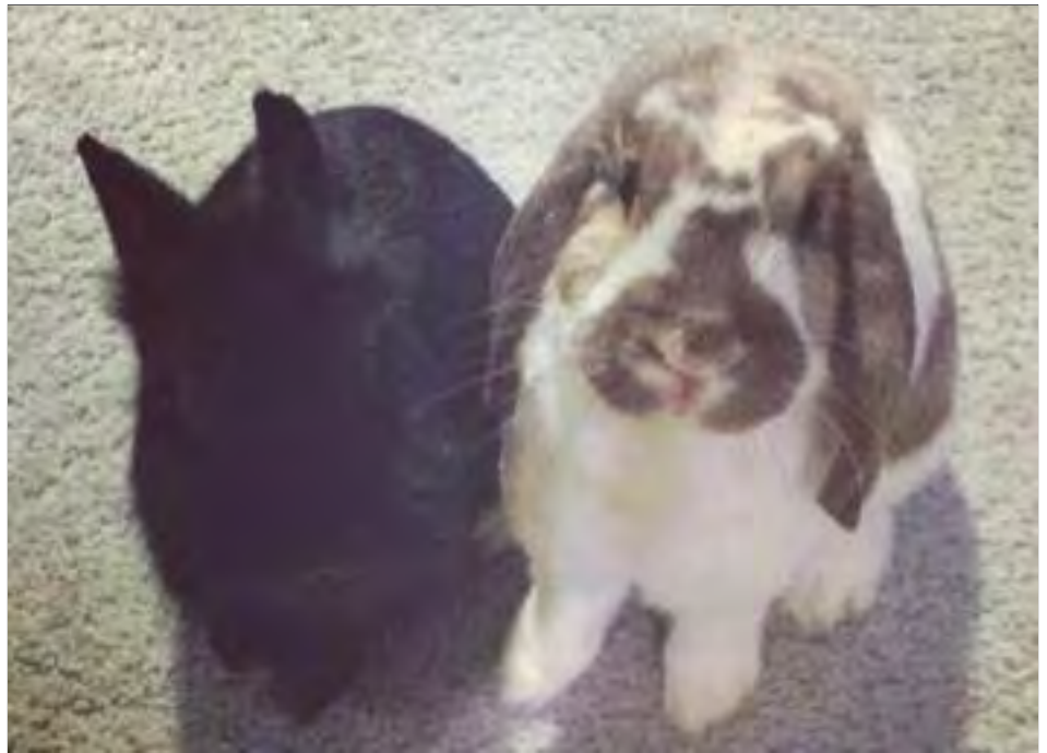
Scribble and Trixie.

an 8-month old lionhead by the name of Malo. He is now known as Scribble.