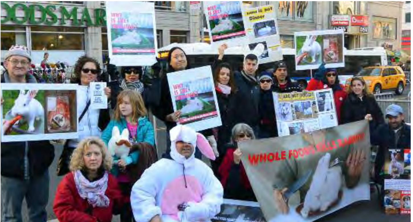
Rabbit volunteers and others gathered on Sunday, Nov. 23, outside Whole Foods Market on Union Square. Nationwide protests are continuing against the company, which has begun selling rabbit meat in some stores. For more information, go to http://rabbit.org/what-you-can-do-about-whole-foods/