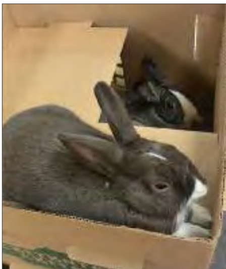
Dutchie and Brownie.