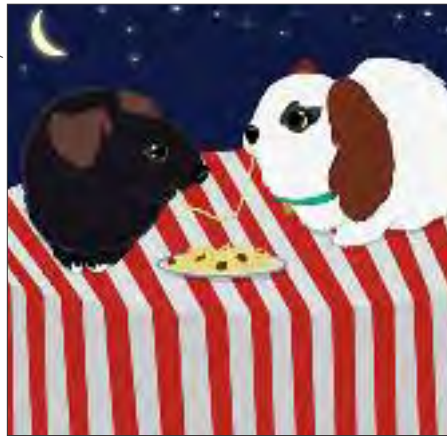
Lady and the Tramp, bunny style!

illustrators I work with made Halloween costume illustrations for staffers' pets,