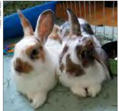
Boom Boom and Radar.