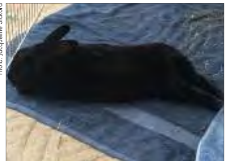
Socrates Efren Sickora.

to the couch. He jumped up next to me and sat down with me.