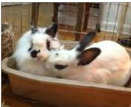
MuMu and Coco.