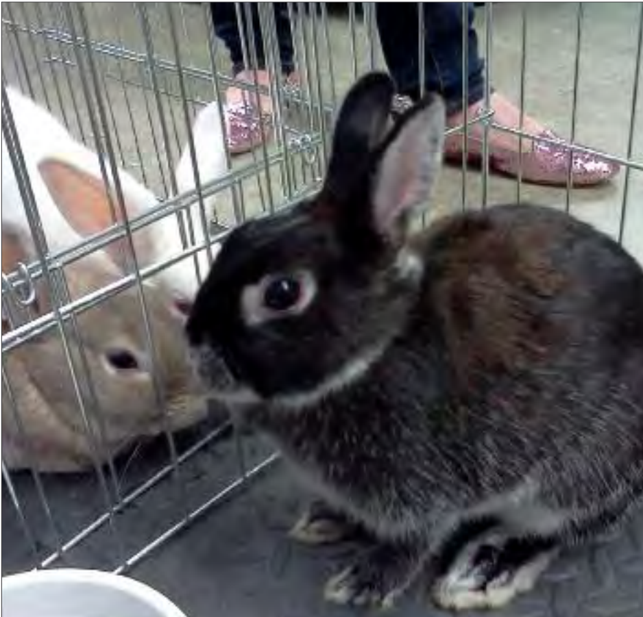
Cici is in the foreground, but if you look, you will see Conrad and Ross peeping at Cici from their pen nearby.