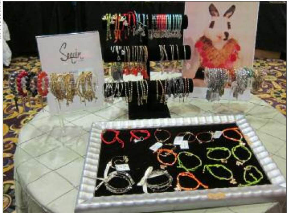
Display of jewelry from Sequin.

Avian and Exotic Medicine, the auction was very successful.