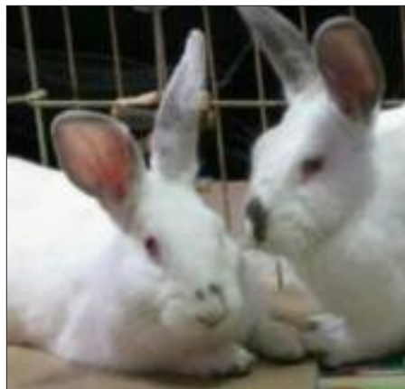
Riff and Raff.