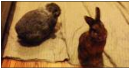
Ludwig and Chloe

set up next to each other in separate pens.