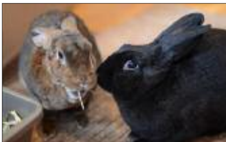
Thor and Beauty.